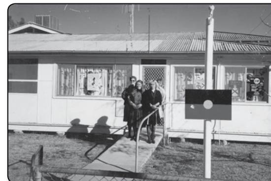
WAMS First Building