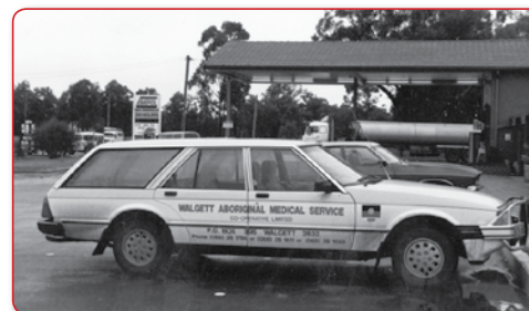
WAMS First Car